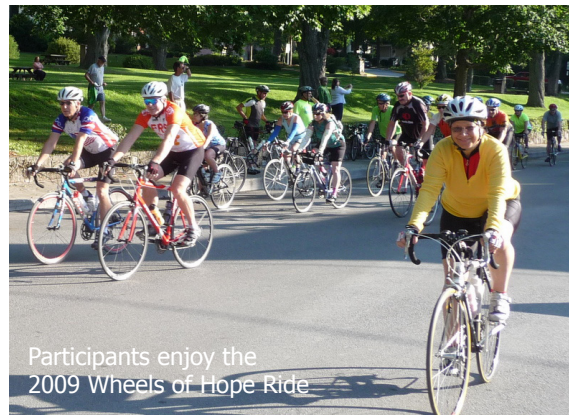
Participants enjoy the 2009 Wheels of Hope Ride

Directions: From the Lewisburg exit on I-64 (exit 169), go south on Rt. 219, turn right at the 3rd traffic light (total 1.5 miles) onto Washington Street (Rt. 60 West). Go through one stop light, then pass Church Street. Take a left after Church Street into the parking lot of the New River Community College.